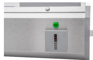
Inductive mechanical counter